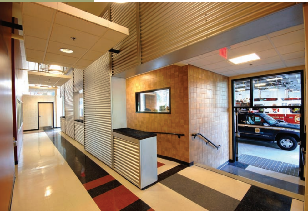
Swatara Township Fire Company Station No. 1

The 2007 Excellence In Design Awards Gala offered a view of some of the best work by area architects completed in recent years. Architectural practices from throughout the region, including Harrisburg, Camp Hill, Mechanicsburg, Carlisle, Lancaster, Lebanon and York, showcased their work at the event providing opportunities for idea sharing, social interaction, and collective appreciation of the disciplines that create our built landscape.