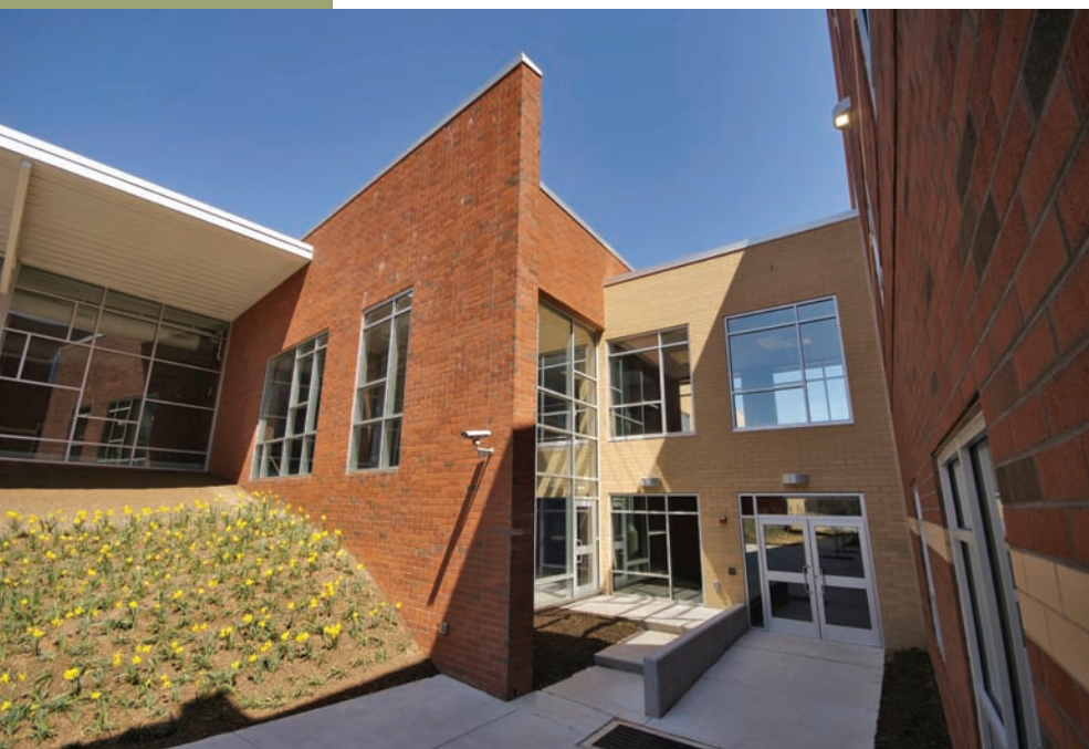
Middletown Township Middle School

The 2007 Excellence In Design Awards Gala offered a view of some of the best work by area architects completed in recent years. Architectural practices from throughout the region, including Harrisburg, Camp Hill, Mechanicsburg, Carlisle, Lancaster, Lebanon and York, showcased their work at the event providing opportunities for idea sharing, social interaction, and collective appreciation of the disciplines that create our built landscape.