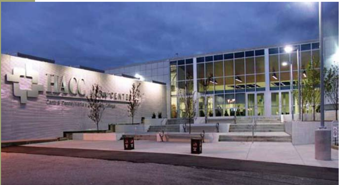
Citation Award Winner: Harrisburg Area Community College – Adaptive Reuse by NuTec Design Associates, Inc.