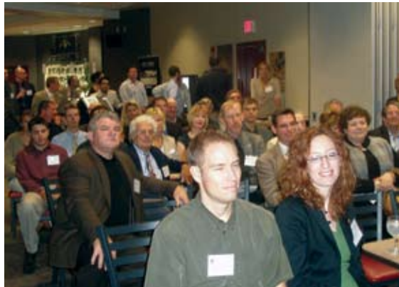
The Design Awards Presentation