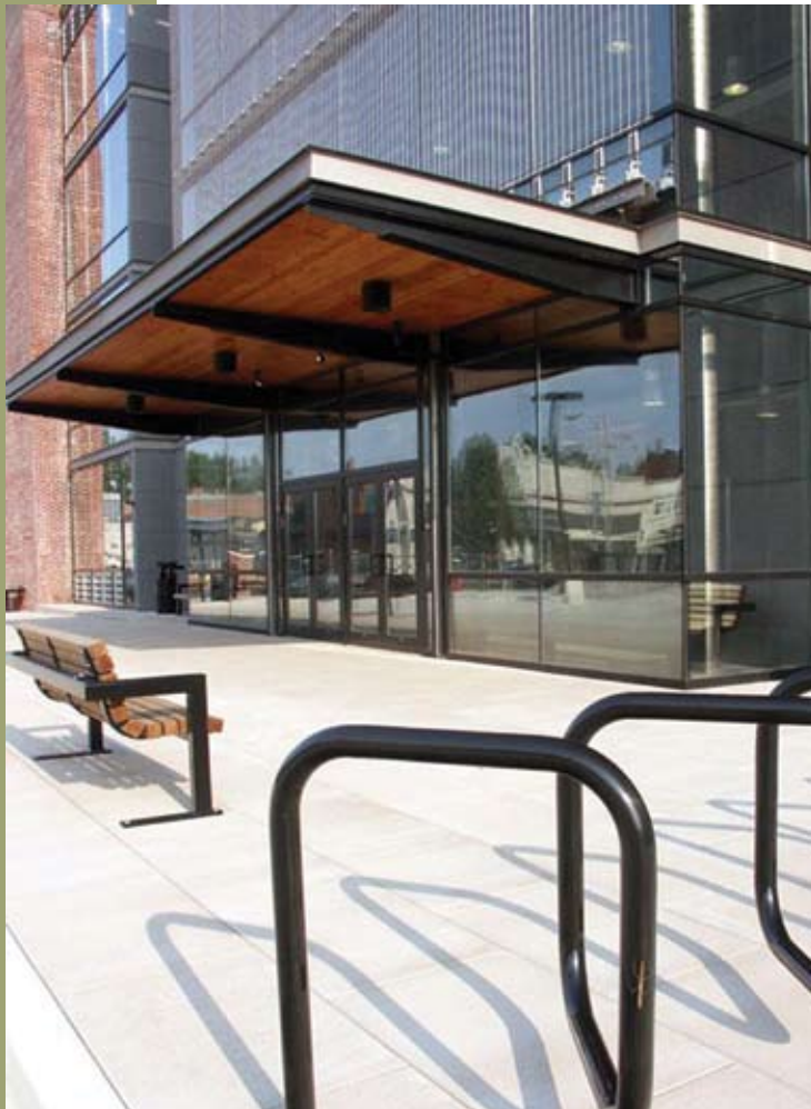
Honor Award Winner: Greenway Tech Centre – Adaptive Reuse by NuTec Design Associates, Inc.