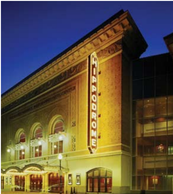
Honor Award Winner: Hippodrome Performing Arts Center – Historic Restoration by Murphy & Dittenhafer, Inc.