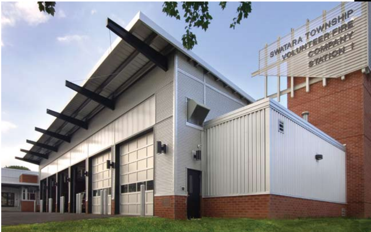
Merit Award Winner: Swatara Township Fire Company Station No. 1 – New Construction by Crabtree, Rohrbaugh and Associates Architects