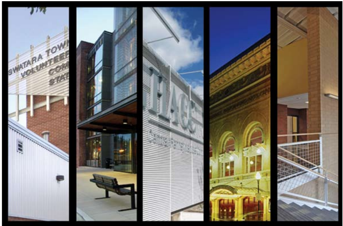
2007 Design Award Winners