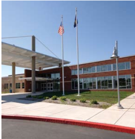
Merit Award Winner: Middletown Middle School – New Construction by Crabtree, Rohrbaugh and Associates Architects

Base Level Sponsors: JDB Engineering and Swirnow Group □